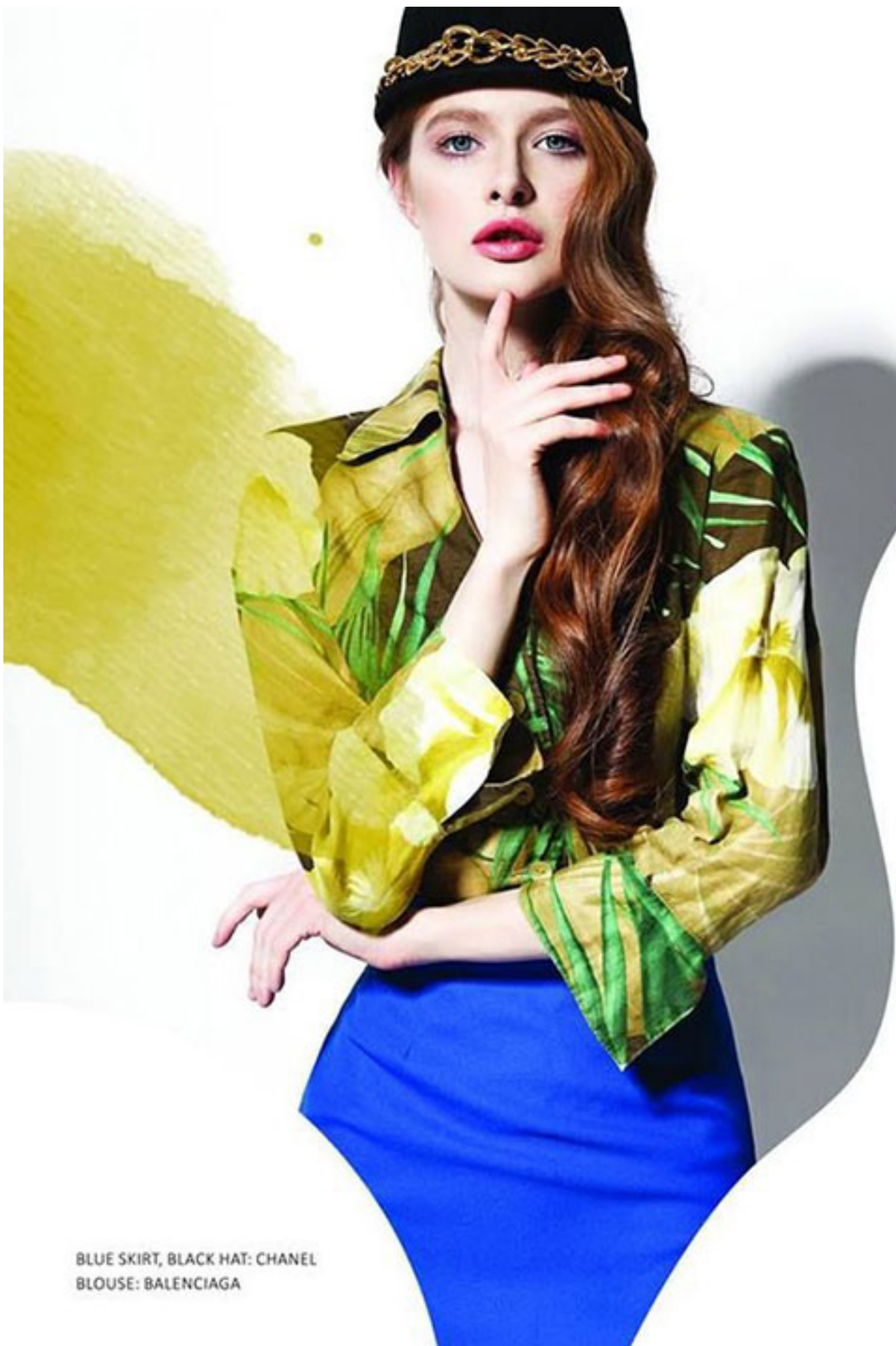
BLUE SKIRT, BLACK HAT: CHANEL BLOUSE: BALENCIAGA