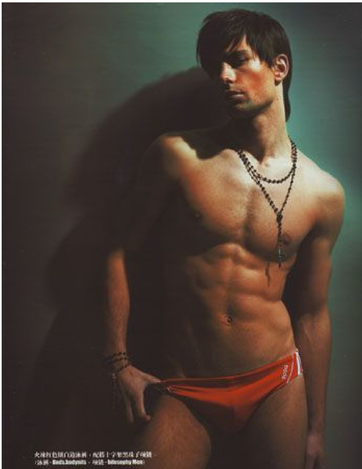
亮麗紅色類白邊泳褲・配搭十字架黑珠子項鍊 泳褲 - Bodyline - 項鍊 - Interesting Man